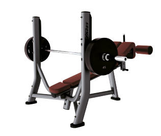
OLYMPIC DECLINE BENCH / LBR-OD