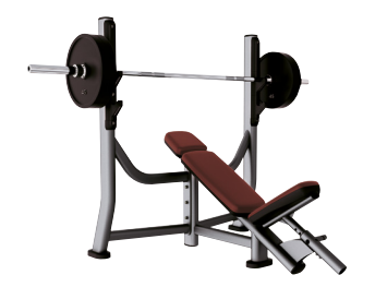
OLYMPIC INCLINE BENCH / LBR-OI

Premium benches and racks. like this Olympic squat rack, seamlessly integrate with other equipment to complete a training floor complete with premium strength training products. Includes five racking positions and eight weight horns.