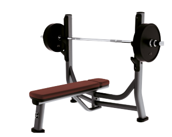
OLYMPIC FLAT BENCH / LBR-OF